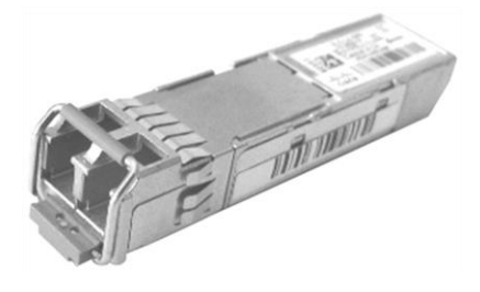
Figure 1. Cisco Optical Gigabit Ethernet SFP

The industry-standard Cisco<sup>®</sup> Small Form-Factor Pluggable (SFP) Gigabit Interface Converter (Figure 1) links your switches and routers to the network. The hot-swappable input/output device plugs into a Gigabit Ethernet port or slot. Optical and copper models can be used on a wide variety of Cisco products and intermixed in combinations of 1000BASE-T, 1000BASE-SX, 1000BASE-LX/LH, 1000BASE-EX, 1000BASE-ZX, or 1000BASE-BX10-D/U on a port-by-port basis.