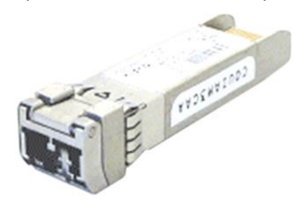
Figure 1. Cisco 10GBASE SFP+ modules

The Cisco® 10GBASE SFP+ modules (Figure 1) give you a wide variety of 10 Gigabit Ethernet connectivity options for data center, enterprise wiring closet, and service provider transport applications.