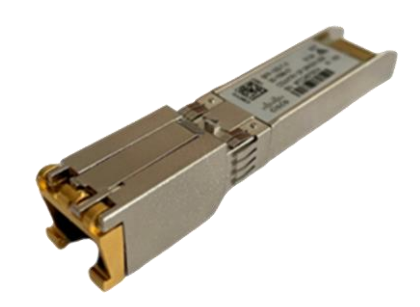
Figure 2. Cisco SFP+ 10GBASE-T module with RJ-45 connector

The Cisco 10GBASE-T module (Figure 2) offers connectivity options at the following data rates: 100M/1G/10Gbps. It has the SFP+ form factor and an RJ-45 interface so that CAT5e/CAT6A/CAT7 cables can be used to connect to end points with embedded 10GBASE-T ports. They are suitable for distances up to 30 meters and offers a cost-effective way to connect within racks and across adjacent racks.