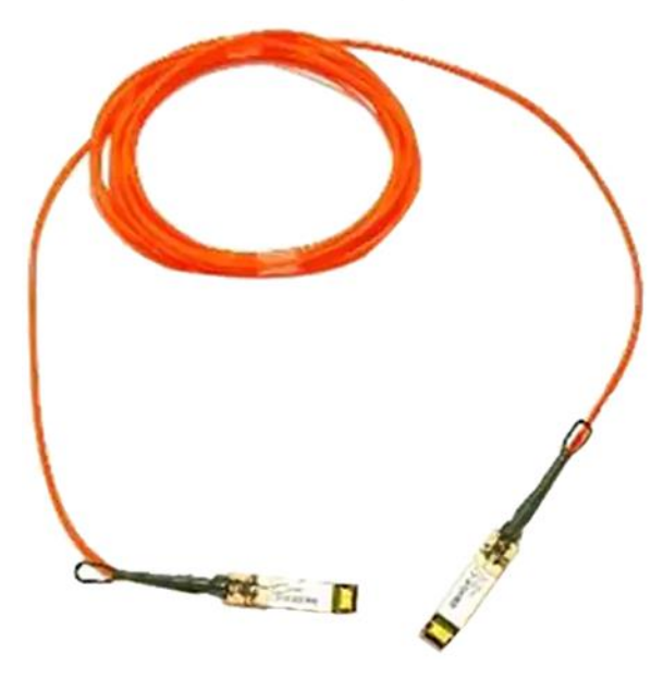
Figure 5. Cisco direct-attach active optical cables with SFP+ connectors

Cisco SFP+ Active Optical Cables (Figure 5) are direct-attach fiber assemblies with SFP+ connectors. They are suitable for very short distances and offer a cost-effective way to connect within racks and across adjacent racks. Cisco offers Active Optical Cables in lengths of 1, 2, 3, 5, 7, and 10 meters.