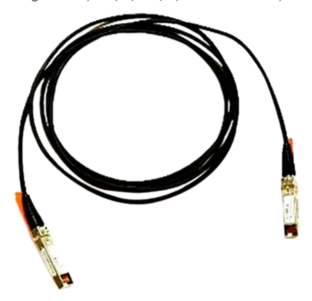
Figure 4. Cisco direct-attach twinax copper cable assembly with SFP+ connectors

Cisco SFP+ Copper Twinax (Figure 4) direct-attach cables are suitable for very short distances and offer a cost-effective way to connect within racks and across adjacent racks. Cisco offers passive Twinax cables in lengths of 1, 1.5, 2, 2.5, 3, 4 and 5 meters, and active Twinax cables in lengths of 7 and 10 meters.