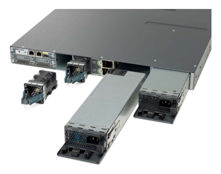
Table 6 shows the different power supplies available in these switches and available PoE power.