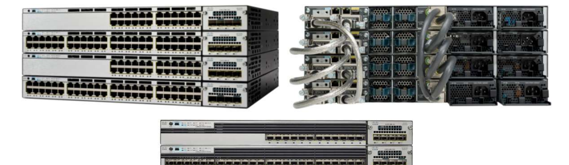
Table 1 shows the Cisco Catalyst 3750-X Series configurations.

Figure 1. Cisco Catalyst 3750-X Series Switches (Front and Back)